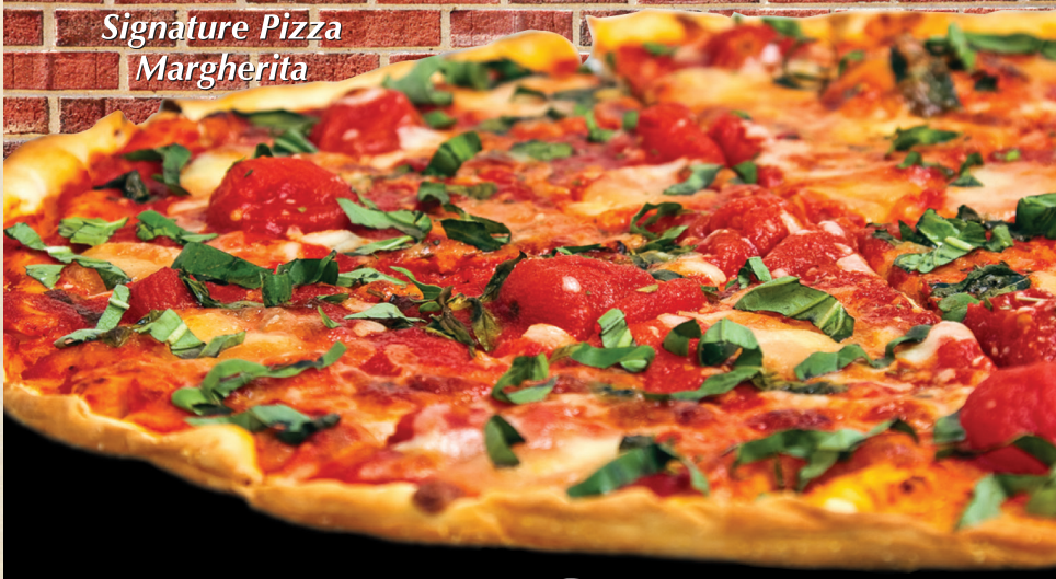
Signature Pizza Margherita

Current Carry Out Hours: Monday-Thursday 3pm-8:15pm • Friday 11:15am-9:15pm Saturday 3pm-9:15pm • Sunday 3pm-8pm Hours are subject to change Last kitchen order taken 15 minutes prior to closing.