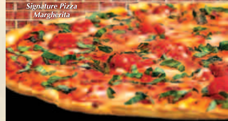
Signature Pizza Margherita

Current Carry Out Hours: Monday-Thursday 3pm-8:30pm • Friday 11:30am-9:30pm Saturday 3pm-9:30pm • Sunday 3pm-8pm Hours are subject to change Last kitchen order taken 15 minutes prior to closing.